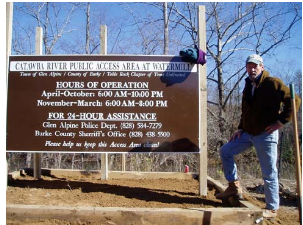
Sign at the new Watermill access ramp on the Catawba River