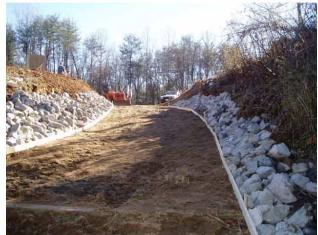
Looking up at the launch ramp at the Watermill access site

FlyFishing Poetry: The flask frae my pocket I poured into the socket. For I was provokit unto the last degree: And to my was o' thinking There's naething for't but drinking' When a trout he lies winkin' and lauchin' at me. W.C. Stewart